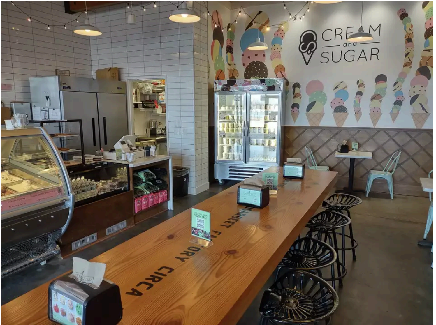
Michigan Cream & Sugar in Bay City

Michigan Cream & Sugar Ice Cream Company is making quite a name for itself as a popular Uptown Bay City retail shop.