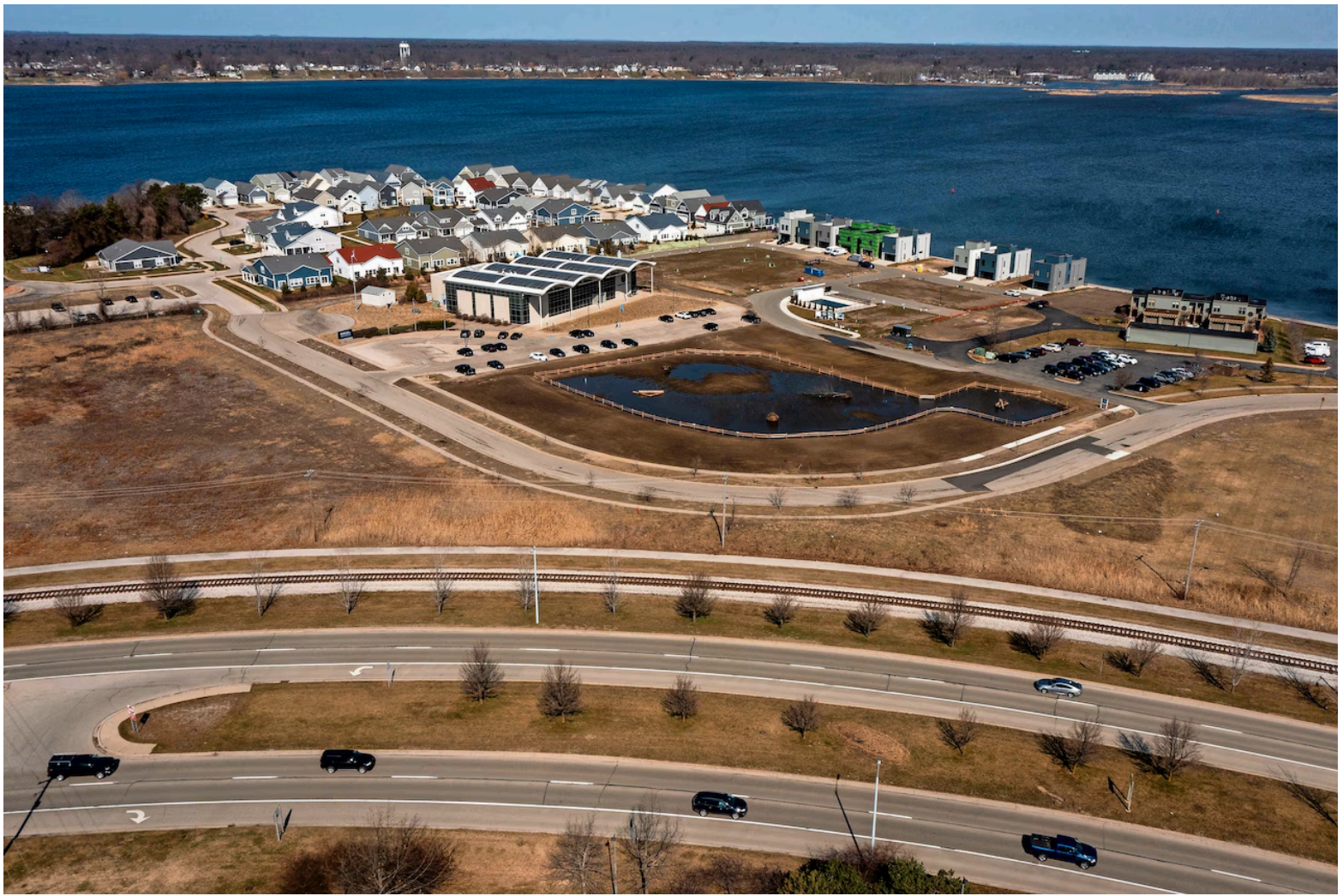
The Muskegon Innovation Hub at Grand Valley State University is set to host the inaugural Lakeshore Business Growth Expo on Wednesday, Nov. 5.